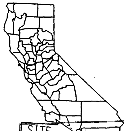
EXHIBIT "A" LOCATION MAP - WP5702 APN 178-652-36 16712 CORAL CAY LANE HUNTINGTON BEACH ORANGE COUNTY, CA.

SITE CALENDAR PAGE 000210 065702 MINUTE PAGE CNP 99