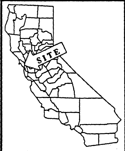
EXHIBIT "A" Site Map WP 5805 Dredging Long Wharf, Chevron Richmond Refinery San Francisco Bay Contra Costa Co.

NOTE: THIS EXHIBIT IS SOLELY FOR THE PURPOSE OF GENERALLY DEFINING THE LEASE PREMISE, AND IS NOT INTENDED TO BE, NOR SHALL IT BE CONSTRUED AS, A WAIVER OR LIMITATION OF ANY STATE INTEREST IN THE SUBJECT OR ANY OTHER PROPERTY.