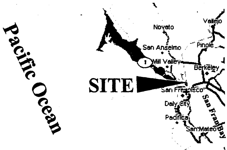
Exhibit A PRCs 709,2036,7780 MOE SAND CO. San Francisco Bay San Francisco and Marin Counties