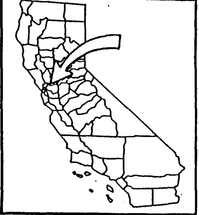
EXHIBIT "A" APPLICATION TO AMEND DREDGING LEASE Marin Yacht Club Western Dock Enterprises WP 6459