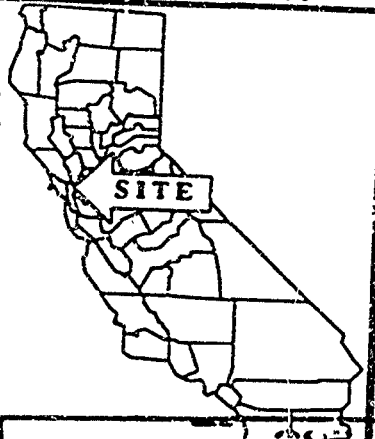
EXHIBIT "A" APPLICATION FOR DREDGING PERMIT AMENDMENT CITY OF BERKELEY W 24690 SAN FRANCISCO BAY ALAMEDA COUNTY