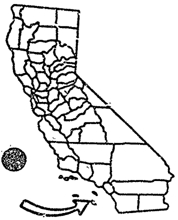
EXHIBIT "B" PRC 6444

San Barbara Island Santa Barbara Channel Santa Barbara Channel