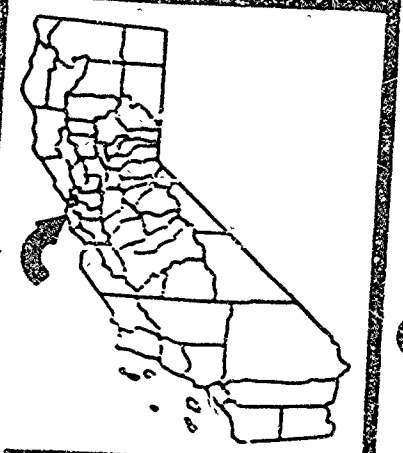
EXHIBIT "A" Application For Dredging Permit San Mateo County Harbor District San Mateo County Pillar Point Harbor PRC 6619