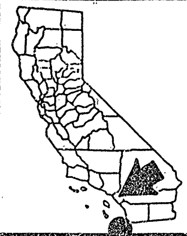
EXHIBIT "A" DREDGING PERMIT CHANNEL REEF ASSOCIATION W 24514 NEWPORT BAY AT CORONA DEL MAR ORANGE COUNTY