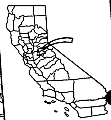
EXHIBIT "B" W 2400.170