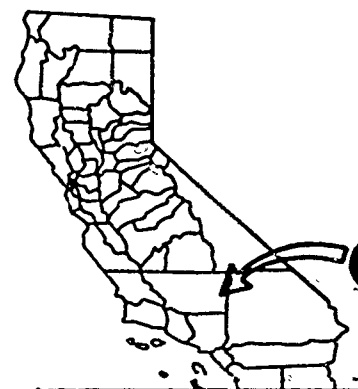
EXHIBIT "B" WP 3803.2