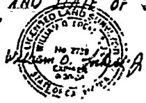
EXHIBIT "E" PLAT SHOWING PROPERTY TRANSFER BETWEEN GEORGE DEXTER, CITY OF SAN RAFAEL AND STATE OF CALIFORNIA SCALE - 1"=50' APRIL 1988