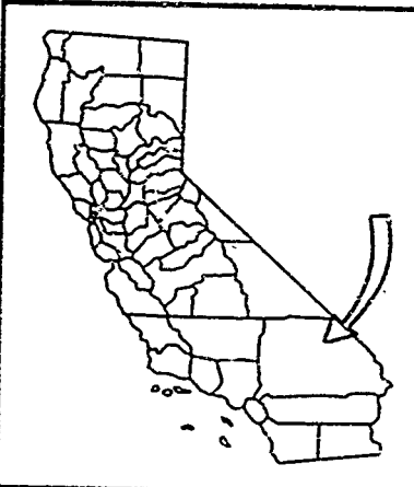
EXHIBIT "B" PRC 6892.2 PRC 6893.2