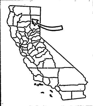
EXHIBIT "5" Sha 3359