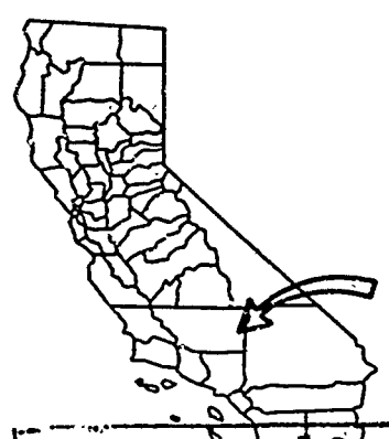
EXHIBIT "B" WP 3803.2