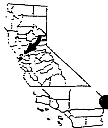
EXHIBIT "A" PRC 6723.1

Delta King Moccasin= 0.393 ac Dock Use= 0.512 ac