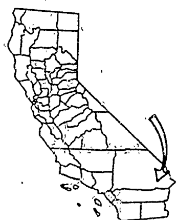
EXHIBIT "A" W 23454