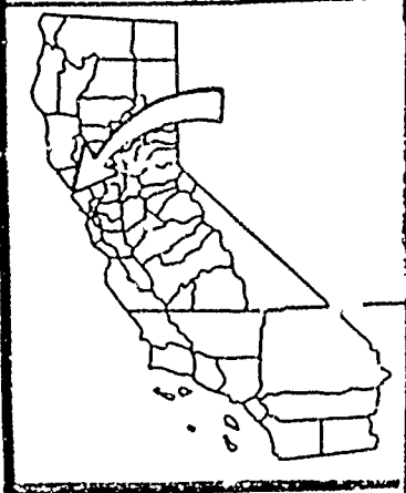
EXHIBIT "A" APPLICATION FOR DREDGING PERMIT W23305 PILLAR POINT HARBO SAN MATEO COUNTY HARBOR DISTRICT (APPLICANT)