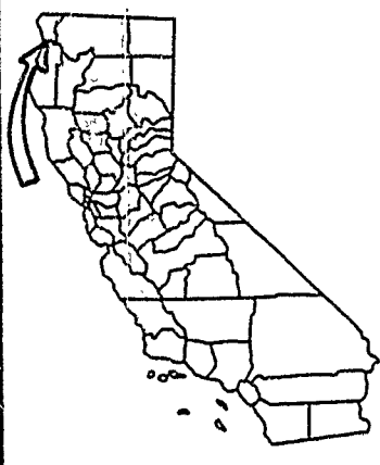
EXHIBIT "B" W 21068