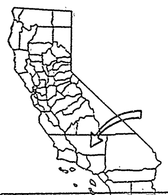
EXHIBIT "A" W 503.1245