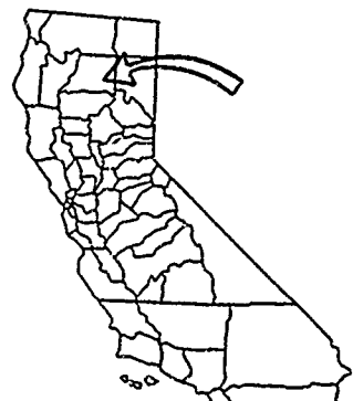
EXHIBIT "A" W 22484