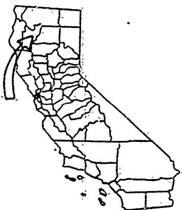
Exhibit "A" W21993