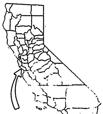
EXHIBIT "A" C 16-03