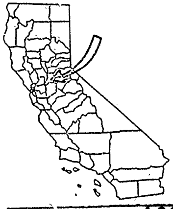
EXHIBIT "B" W 320.660