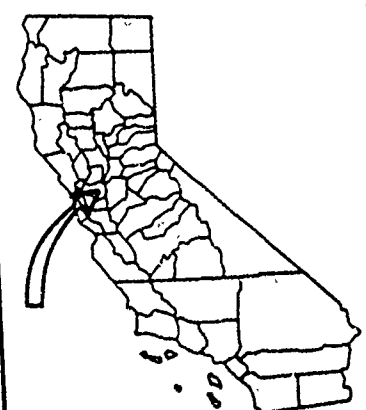
EXHIBIT "B" W 20355